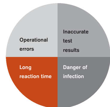
Potential problems when using alcohol measurement equipment

In situations such as this, a strong personality and an exceptional instrument is a must. Equipment which is easy to use with short reaction times. Equipment which delivers one hundred percent reliable data and at the same time offers the user the highest degree of safety. Equipment such as the newly developed Dräger Alcotest® 6510, which is based on decades of experience and the most modern technology.